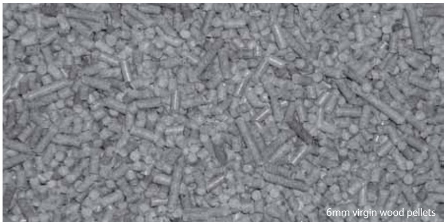
6mm virgin wood pellets

The Renewable Energy Association (REA) represents renewable energy producers and promotes the use of all forms of renewable energy in the UK.