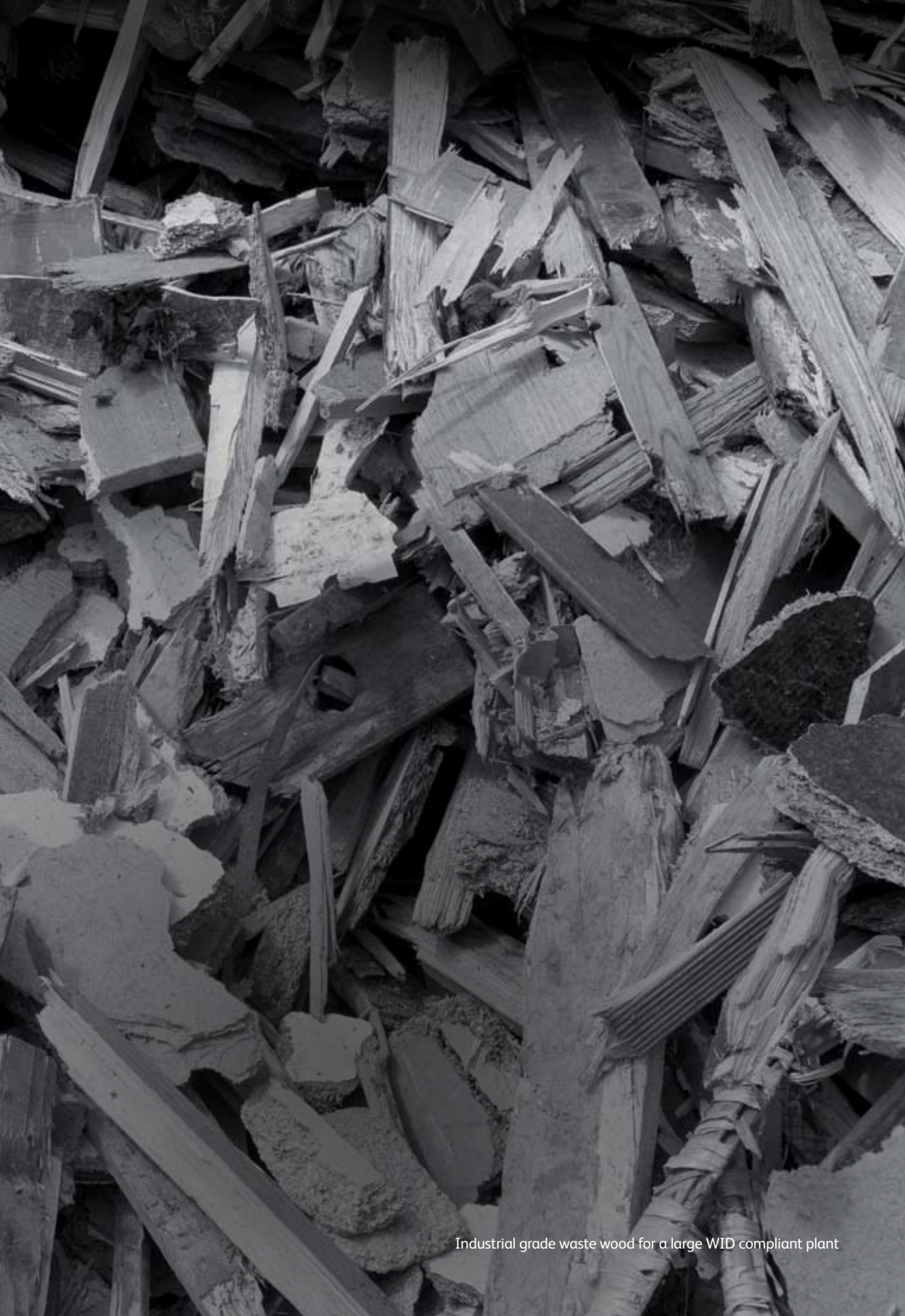
Industrial grade waste wood for a large WID compliant plant