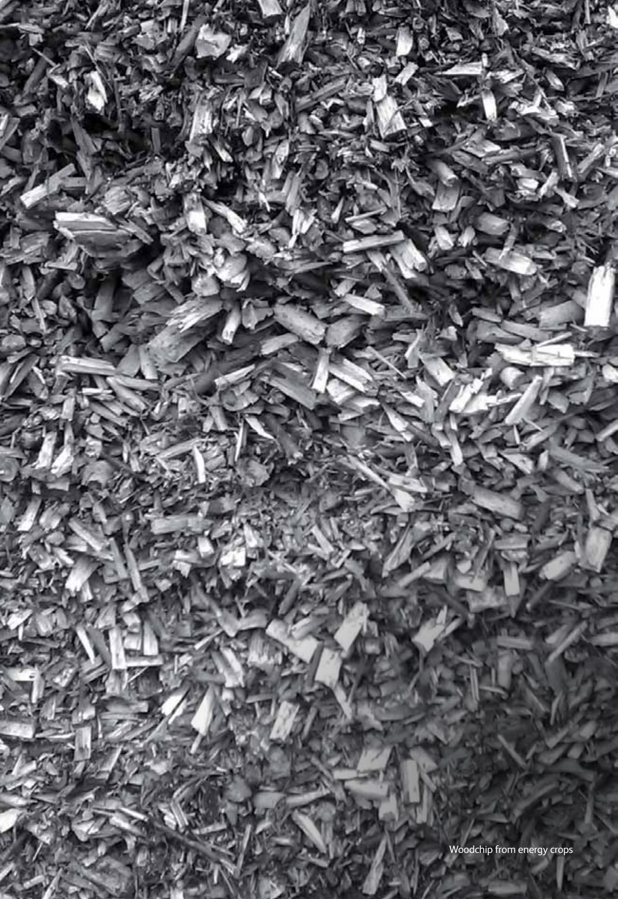
Woodchip from energy crops