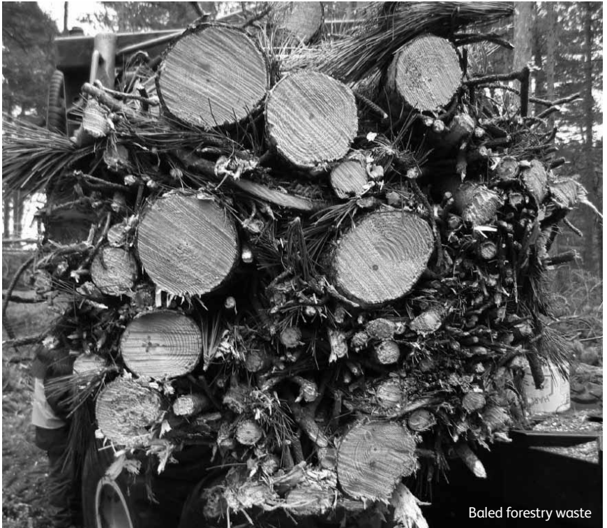
Baled forestry waste

All entries listed within the directory can offer advice and expertise to ensure that you will find the best fuel solution for your business.